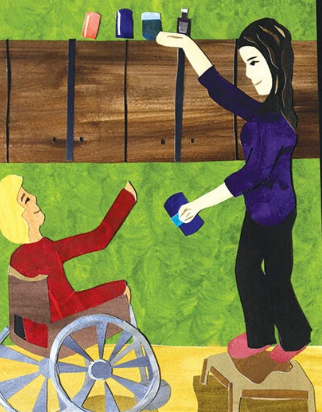
You have the Right to Ask for Help