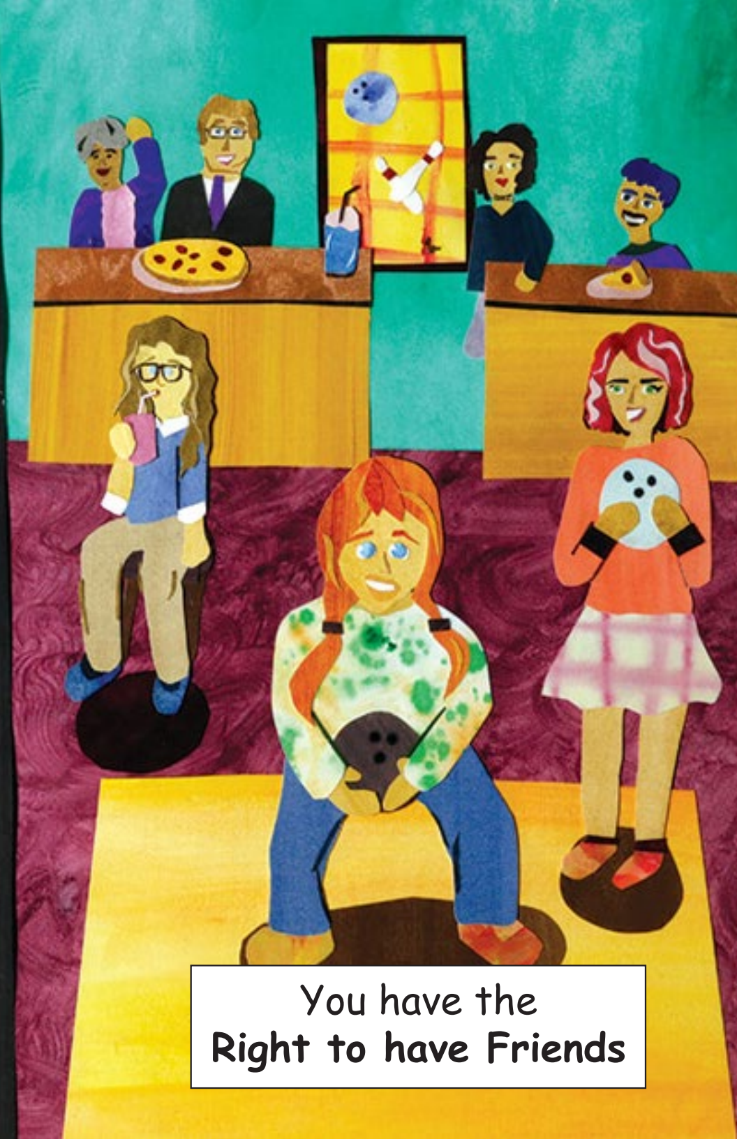
You have the Right to have Friends